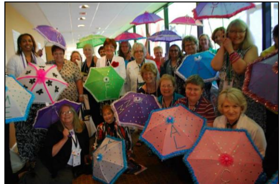
State Presidents' Meeting at the National Convention.

The goals I want to pursue for 2013-14 are to reach out to add new college/university partners, enhance existing partnerships, and expand recruitment of e-student affiliates; develop coalitions with other state organizations on common public policy goals and strengthen public policy; and increase overall membership and resurrect prior AAUW branches.